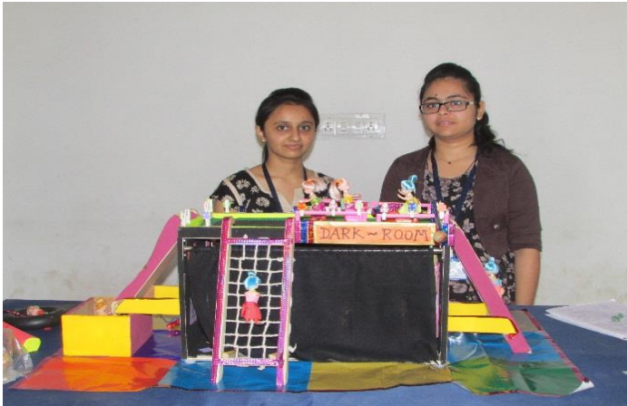
Model Exhibition on DarK Peadiatric Room