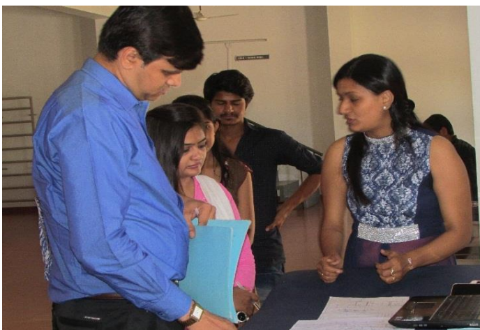
Model Exhibition on RKU Walker